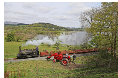
Bala Lake Railway

Catch up with our Easter events round-up, here.